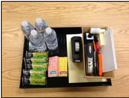
Amenities Tray for Room Reservations

To help offset rising costs and to tailor services to better match what our patrons need, we revisited all of the fee-based services we provide and in some cases made adjustments to pricing and scope. In addition, we added new services such as the sale of office supplies like writing pads, envelopes and stamps and the option to purchase an "amenities" tray when patrons reserve one of our conference rooms. The new tray includes a range of meeting supplies, bottled water and portable snacks.